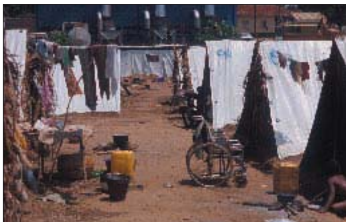
Above and below: makeshift and crowded housing in temporary camps create ideal conditions for malaria transmission.